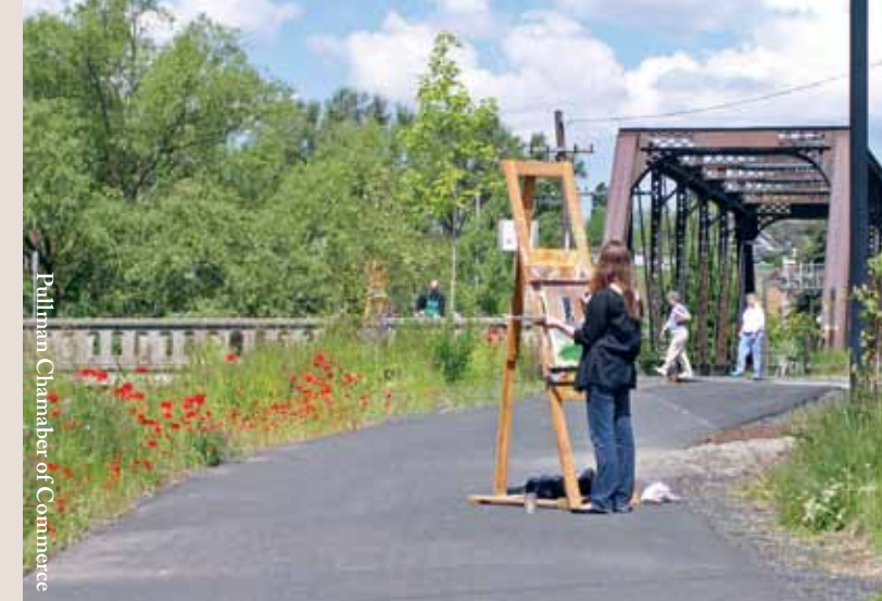
Enjoying the artistic beauty of the trails

Stroll, run or bike along these trails and pathways past parks, creeks, fields, over bridges and through downtown Pullman and experience the beauty of Pullman and the Palouse from a new perspective.