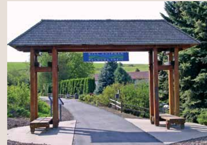
below: Trailhead for the Bill Chipman Palouse Trail.