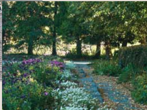
above: The waterfalls along the Riverwalk section of the Pullman Trails. right: Enjoy the native plants and flowers along the miles of paths and trails in Pullman.